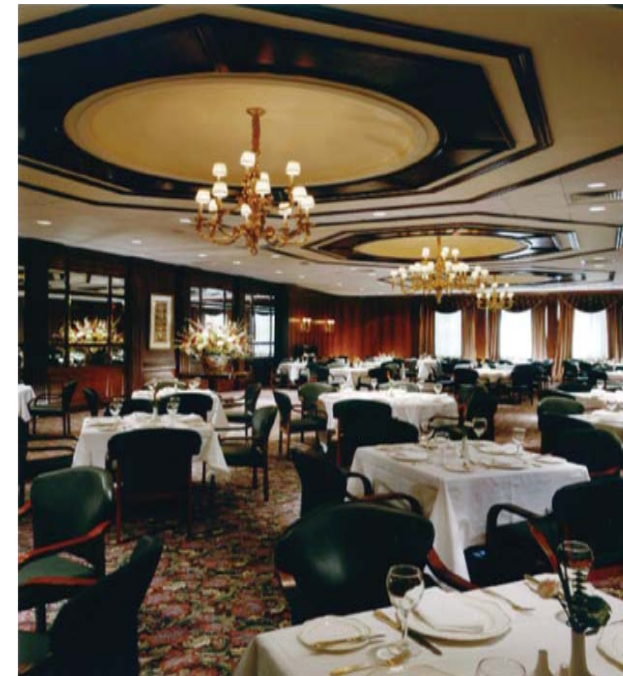
1990 Locust Club Renovation