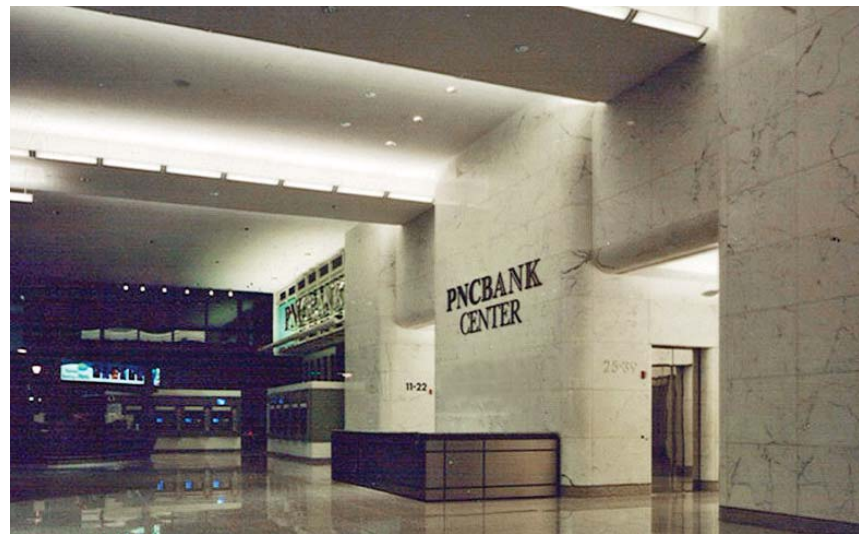
1995 PNC Bank Center