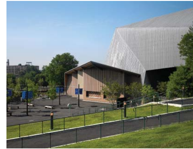
2006 Mann Center for the Performing Arts