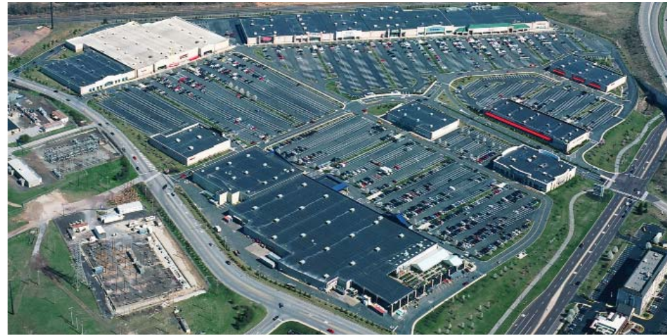
1999 Metroplex West Shopping Center