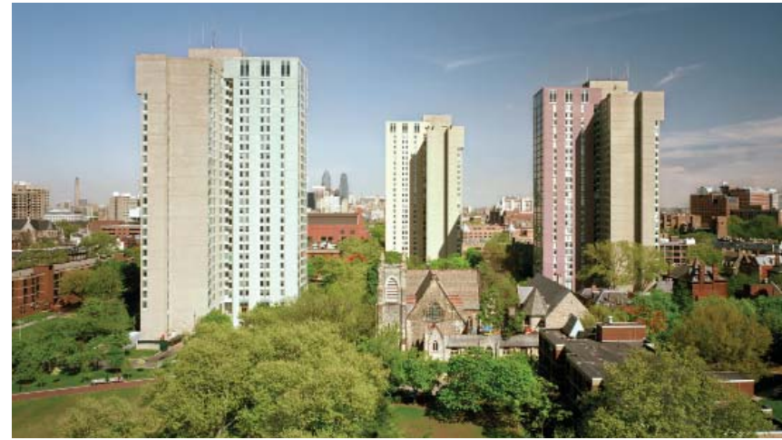
2002 University of Pennsylvania, Hamilton Village Towers