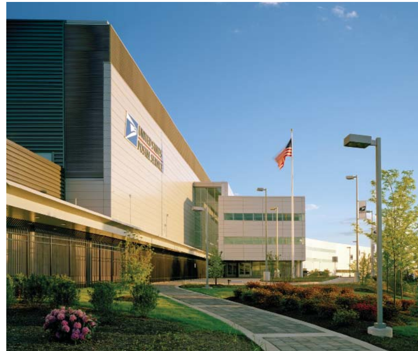
2003 United States Postal Service, Processing and Distribution Facility