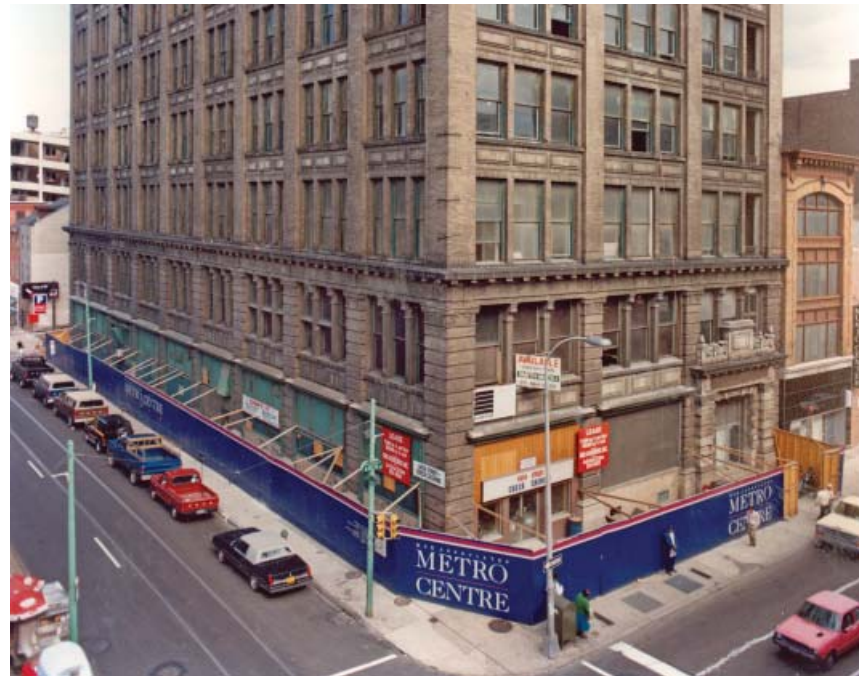
1987 Metro Centre

With gratitude to our customers, supporters, and friends, INTECH Construction takes a moment to reflect upon our thirty years in business as Philadelphia builders. Since January 13, 1986, our core values have remained consistent and strong, to build projects of high quality, delivered with unparalleled service. Even as we pause to consider our past, we look forward, with humility, to the successes of our future.