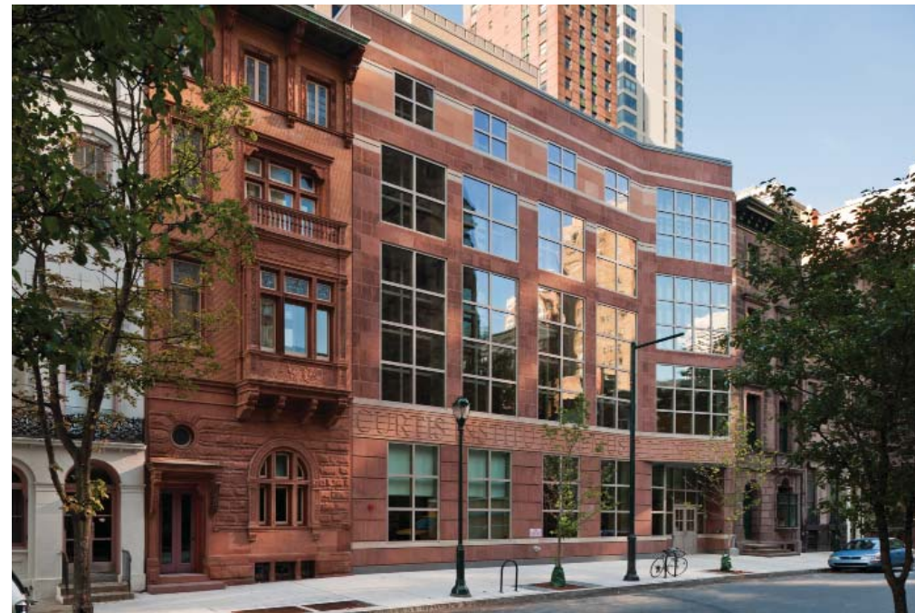
2011 Curtis Institute of Music, Lenfest Hall