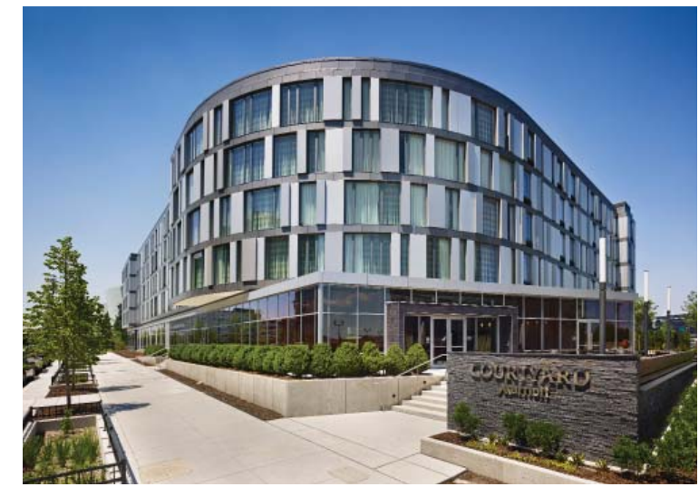
2013 Courtyard Philadelphia South at The Navy Yard