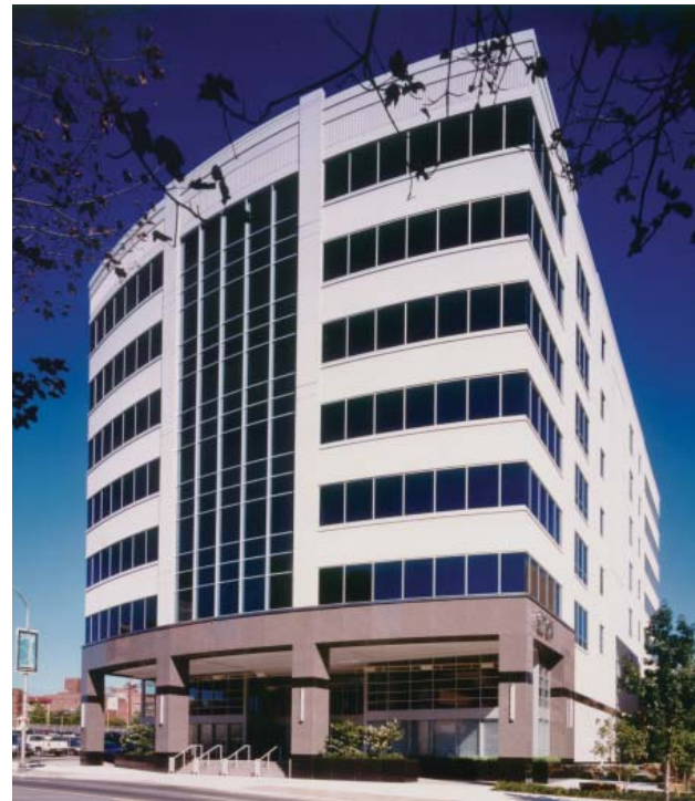
2000 The Pennsylvania Port of Technology