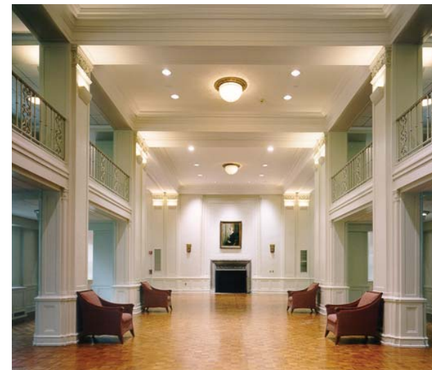
1996 Drexel University, Van Rensselaer Hall