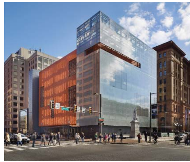
2010 National Museum of American Jewish History