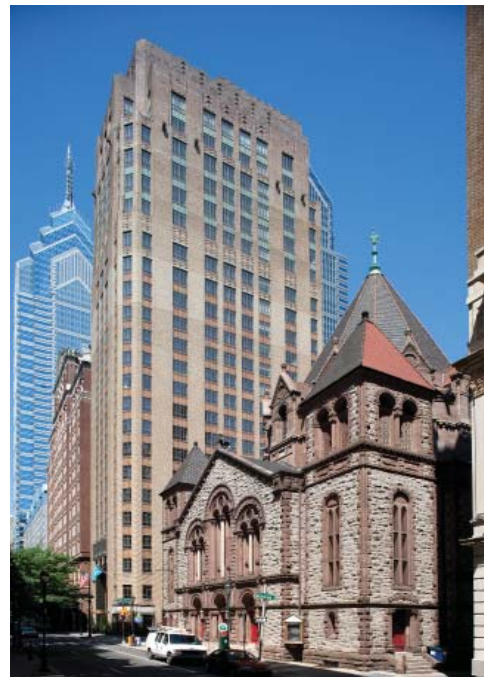
2009 Hotel Palomar