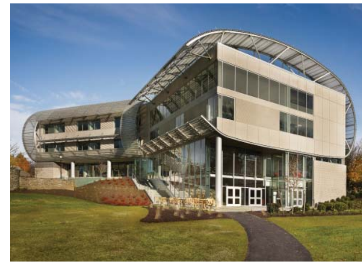
2012 Philadelphia University, DEC Center