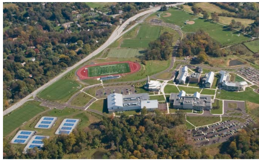
2008 The Episcopal Academy, New Campus