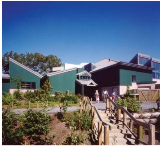
1997 Philadelphia Zoo, Primate Reserve