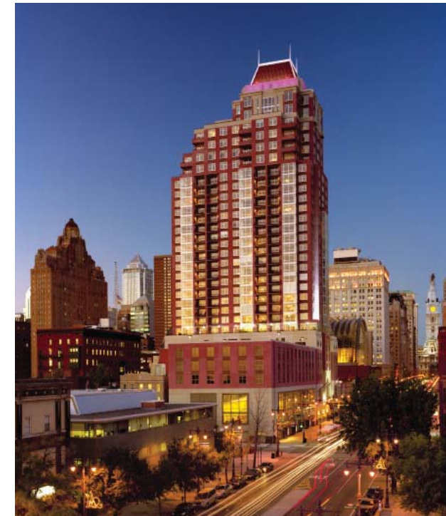
2005 Symphony House Condominiums